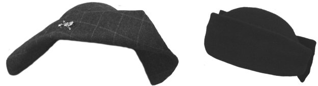
Figure 2 Formed headwear by hydro-jet method

Based on the results of research, made two models of headwear with molded heads in real size by hydro-jet method (Figure 2).